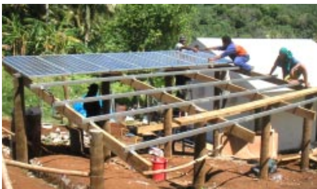
Installation phase of the Photovoltaic (PV) based power system on Apolima Island in Samoa, 2006

Currently power is provided for only a few hours a day from an unreliable, noisy, and expensive diesel generator. In a joint effort, the Government of Samoa and Electric Power Corporation (EPC), with support from a Danish NGO and UNDP, will replace the current diesel generator with a photovoltaic (PV) based power system. The expected overall outcome of this project is to improve livelihoods through a reliable, effective and environmentally friendly 24-hour power supply. The installation of the PV system is now underway. When commissioned this system will be the biggest solar project in Samoa to date. Furthermore the Apolima system will be the first PV based mini-grid system in any Pacific Island Country, which gives a strong regional aspect. With lessons learnt from this pilot project in Samoa, it is hoped this renewable energy system may be replicated in other PICs.