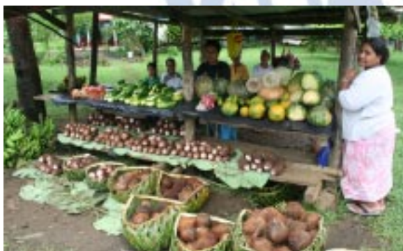
Agriculture in rural Samoa is still largely subsistence farming although it is common to see stalls on the side of the road selling excess produce to boost family income.

Reaching one of the most marginalised groups in society, the UN Volunteers Programme has been undertaking the Empowerment of Rural People with Disabilities (ERPD) project in Samoa funded by the Japan Trust Fund. The project was implemented in 2002-2004 to deliver effective special needs services and to increase the capabilities of people with disabilities to earn income and raise awareness about their needs and potential contributions to society. This programme mobilized 9 international and national United Nations Volunteers (UNVs) to reach parents, teachers and community leaders to improve education and training, home care and livelihoods.