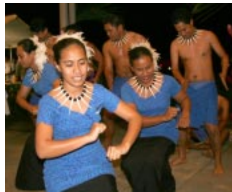
Fostering a strong sense of identity and increasing self-esteem are among the aims of the TALAVOU Cultural Group

Eradication of extreme poverty: Halve by 2015 the proportion of people who suffer from hunger and who live below the national poverty line.